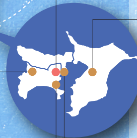
Kawasaki Port Area Distribution Center