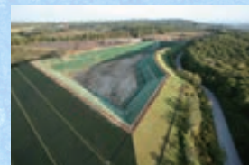
Hayakita Disposal Site