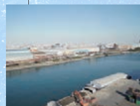
Kawasaki EPC Division