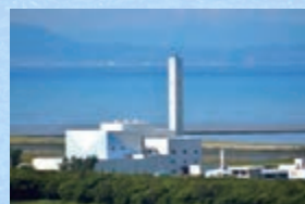
[Administrative facility] Kita Ishikari Sanitation Center