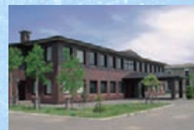
Abira Laboratory (Abira Lab.)